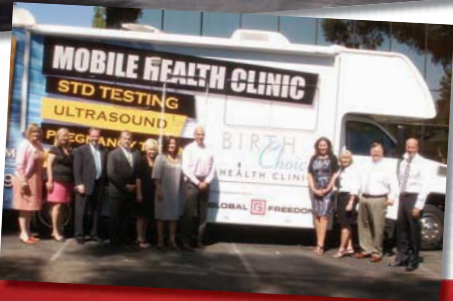
Birth Choice Board Members get a first look at their new "clinic on wheels"

THURSDAY, SEPTEMBER 30TH 4:30 - 7:00PM AT BIRTH CHOICE HEALTH CLINIC 415 N. SYCAMORE STREET, SUITE 200 SANTA ANA 92701